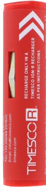
3115.150.50 Timesco R Engine Medium (C Size), 2.5v