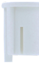
3125.100.16 Timesco R Engine Charger Insert (AA Size)