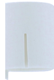
3125.100.17 Timesco R Engine Charger Insert (C Size)